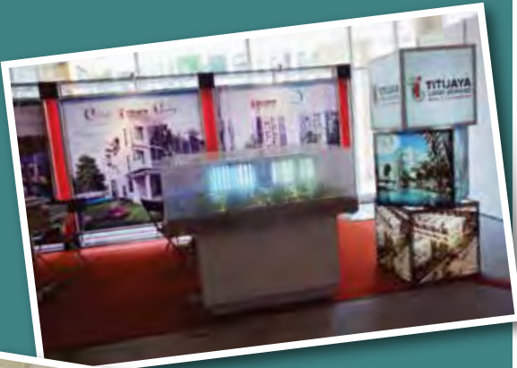
Kajang Metro Point