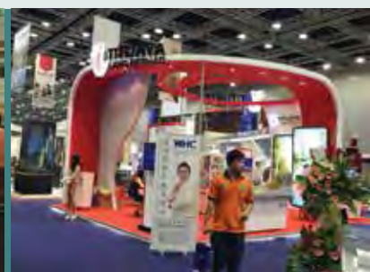
KLCC - iproperty event 17/4-19/4/15