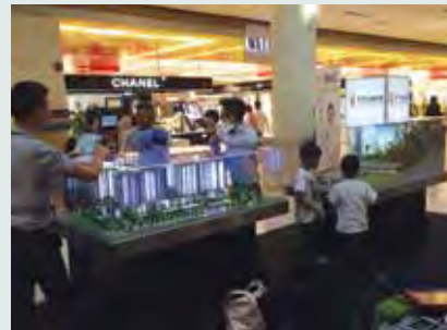
Roadshow at The Curve (in front of Metrojaya) 22/4-26/4/15

Titijaya Land Berhad showcased its property offerings at various locations within the Klang Valley and Terengganu in the first quarter of the month.