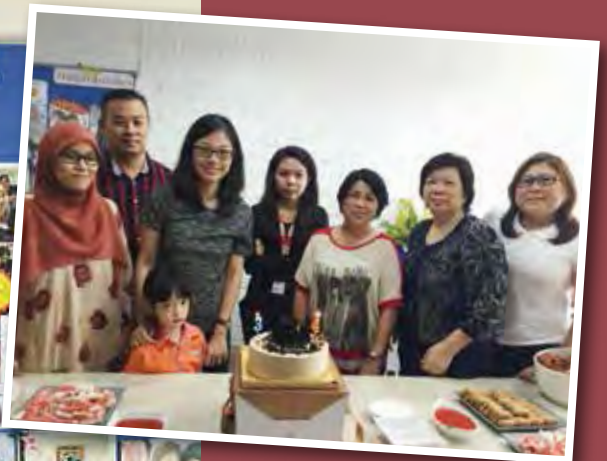
March & April babies