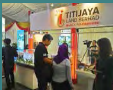
Puchong Financial Corporate Centre