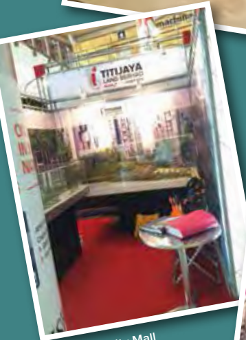
Setia City Mall