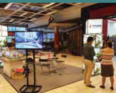
Ikano Power Centre

As in every roadshow, the Titijaya sales team are always ready to answer any queries visitors may have and also provide a better insight as well as detailed explanation on the projects that are being promoted.