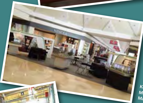
Kerteh Mesra Mall