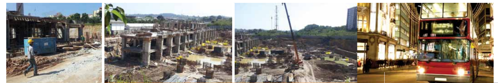
It's fast taking shape! Photos taken at actual construction site as of Jan 2013