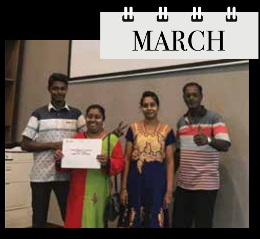
Winner of 5 Days 4 Nights Australia Trip

Property Mega Sales Lucky Draw Campaign with a cash back promotion of up to RM2,018,000 in the fourth quarter of 2018. Buyers who purchased Titijaya's properties during promotion period enjoy a cash back and stood a chance to win a lucky draw prizes to Bangkok and Australia worth up to RM25,000 The winners were announced in March 2019.