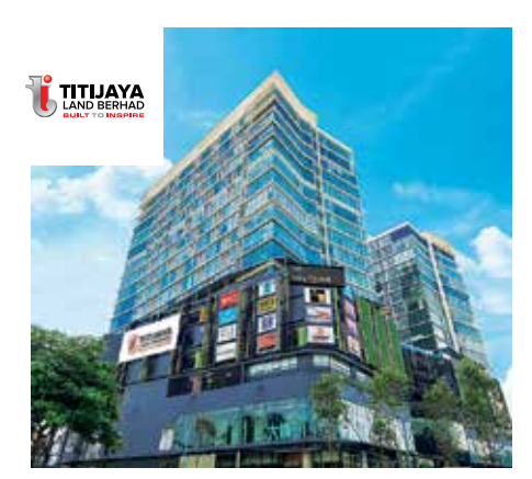
Titijaya Land Berhad (HQ)